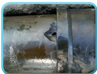
A Leak in Plastic Piping

Carraroe Hotel, Connemara, Galway, urgently contacted us regarding a leak in their Hotel. Despite the attempts of another Leak Detection service provider, they were unable to pinpoint the leak. One of our crew located the leak within a couple of hours of arriving at the Hotel. This is the service we provide.